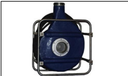
KSF4 with frame