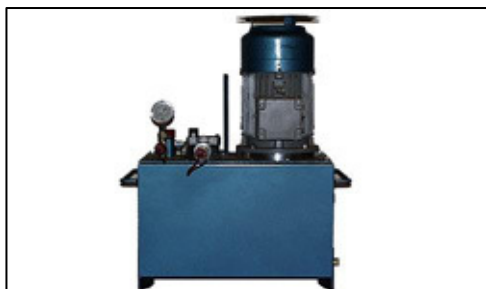
Hydraulic power pack with electric motor